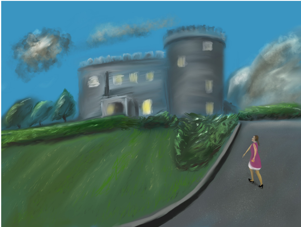
SORTARELLA FINALLY MAKES IT TO THE PALACE FOR THE ROYAL BALL.