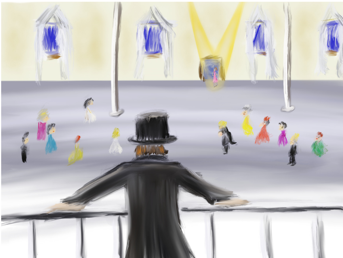
INSIDE, AFTER A QUICK WARDROBE CHANGE, PRINCE CHARMING SCOPES OUT THE BALLROOM FROM THE SECOND FLOOR. AFTER A QUICK PAN OF THE SCENE, HE SUDDENLY SPOTS A VISION IN PINK ENTERING. HE HAD TO MEET HER.